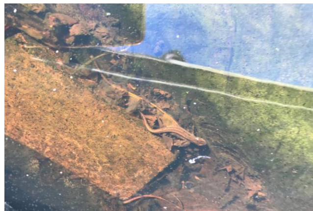
Eco Club members have been litter picking